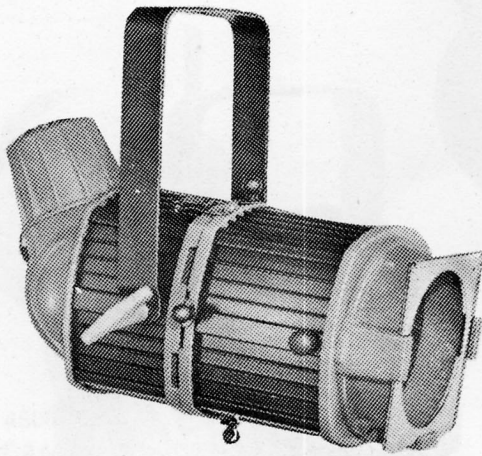
3200 SERIES 6" and 9" ELLIPSOIDAL

All Major Controls' 3000 Series Ellipsoidal Spotlights are provided with a No. 280 'C' clamp, color frame, 4 internal framing shutters, 36" pigtail and connector. When ordering specify: lens; lamp socket; hanging device; feeder cord; plug; beam control (iris or template pattern options).